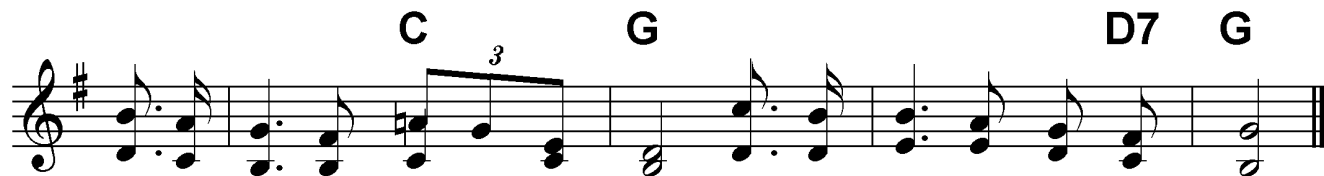
Chart and com-pass come from Thee, Je - sus, Sav - ior, pi - lot me. Won - drous Sov - ereign of the sea, Je - sus, Sav - ior, pi - lot me. May I hear Thee say to me, "Fear not, I will pi - lot thee."

Un-known waves be-fore me roll, Hid -ing rocks and treacherous shoal Bois - t'rous waves o-bey Thy will When Thou sayest to them "Be still!" 'Twixt me and the peace-ful rest, Then, while lean-ing on Thy breast,